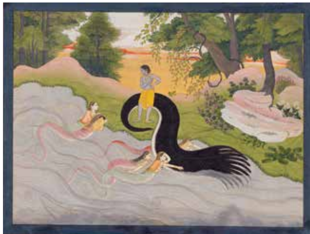
16 The wives of Kaliya beg a triumphant Krishna to spare their husband Page from a Bhagavata Purana series By a Guler artist from the family of Nainsukh and Manaku, c. 1770 Opaque watercolour and gold on paper Folio: 27.2 × 35.1 cm; Painting: 20.7 × 28.2 cm