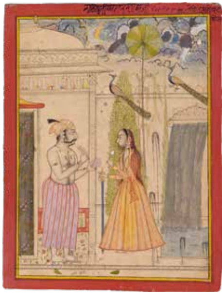
8 Maharana Amar Singh II with a lady in a garden Udaipur, attributed to the ‘Stipple Master’, c. 1705–1708 Opaque pigments on paper 27.5 × 21 cm