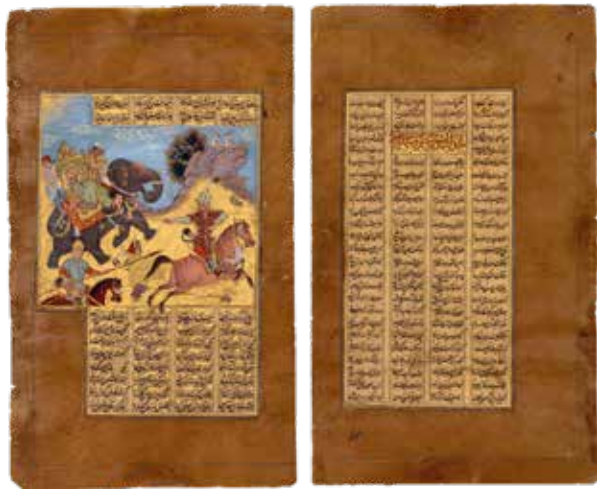
5 Rustam drags the Khaqan of Chin from his elephant Folio from a Shahnama Bijapur, c. 1610 Opaque pigments and gold on paper Folio: 20.3 × 12 cm; Painting: 9 × 9.3 cm