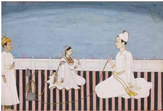
14 A prince smoking a hookah with his consort Bhoti, c. 1780 Opaque pigments and gold on paper Folio: 22.4 × 30.8 cm; Painting: 17 × 25.5 cm