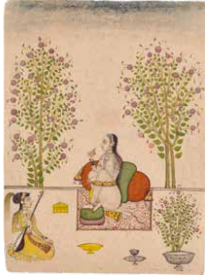
9 Lady relaxing in a garden Sawar, 1710–15 Brush drawing with colours and gold on paper 22.2 × 16.4 cm