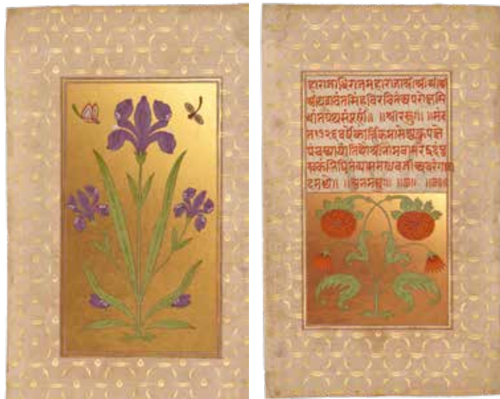
7 An Iris Double-sided folio from the Aparokshasiddhanta of Maharaja Jasvant Singh of Jodhpur Aurangabad, dated 1669–70 Opaque pigments and gold on paper Folio: 31 × 22.2 cm; Painting: 20.32 × 11 cm