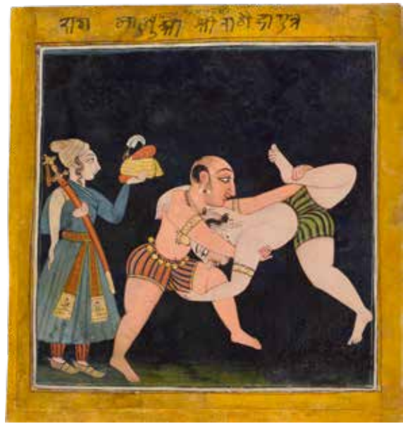
11 Two men wrestling – Ragaputra Malava , son of Sri Raga Page from the ‘ Tandan ’ Ragamala Basohli, c. 1710 Opaque pigments and gold on paper Folio: 20.6 × 19.4 cm; Painting: 16.8 × 16.1 cm