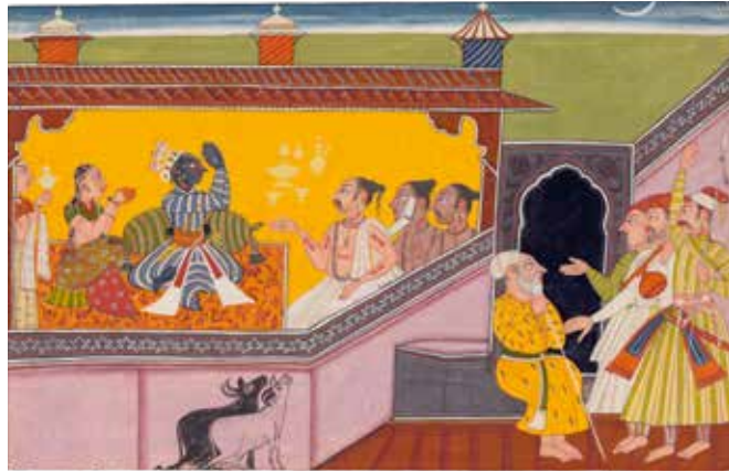
13 The sage Vasishtha instructs Rama and Sita to fast prior to Rama's installation as King Folio from the Ramayana By the Master of Style II of the 'Shangri' Ramayana Bahu (Jammu) or Kulu, c. 1690–1710 Opaque pigments on paper 22.1 × 32.6 cm