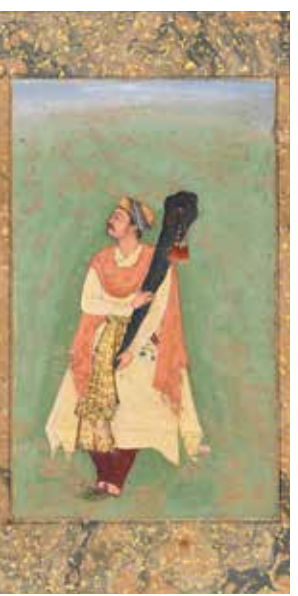
3 A swordbearer ( not illustrated ) Mughal, c. 1590 Opaque pigments and gold on paper Folio: 24.9 × 14.6 cm; Painting: 10 × 8 cm