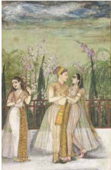
6 A Prince and his Mistress in an embrace Mughal, c. 1640 Opaque pigments and gold on paper Folio: 26.7 × 17.5 cm; Painting: 18.8 × 12 cm