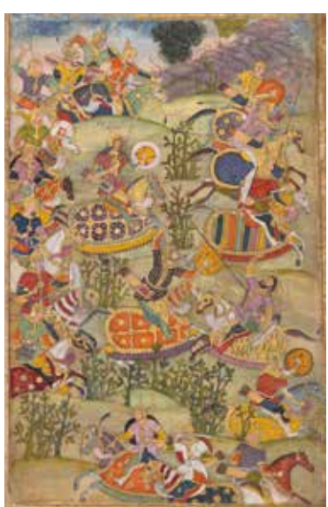
2 The Battle of Sarnal in Gujarat in December 1572 Page from the Third Akbarnama Mughal, 1595–1600 Opaque pigments and gold on paper Folio: 36 × 23.5 cm; Painting: 33 × 20.50 cm