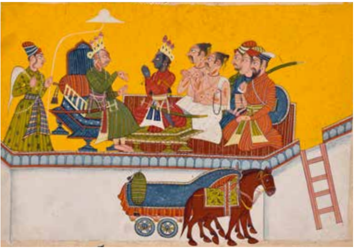
12 Dasharatha tells his son Rama that he is going to install him as King Folio from the Ramayana By the Master of Style II of the ‘Shangri’ Ramayana Bahu (Jammu) or Kulu, c. 1690–1710 Opaque pigments on paper 22.3 × 31.9 cm