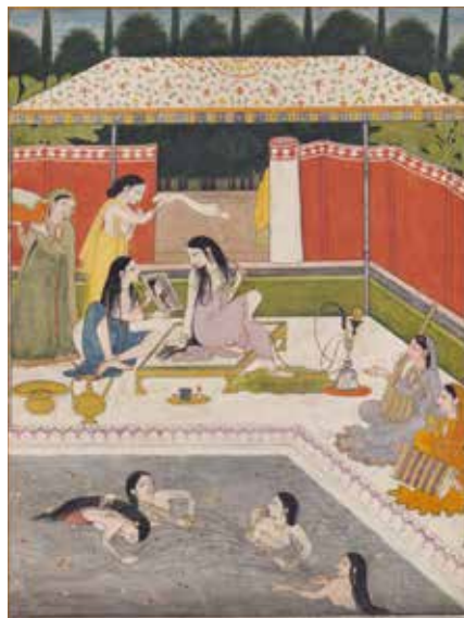
15 A pool party with a princess after the bath By a Guler artist, perhaps Gursahai, c. 1800 Opaque pigments and gold on paper Folio: 25.7 × 20.3 cm; Painting: 23.2 × 17.5 cm