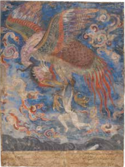
1 Amir Hamza clings to the Rukh's legs to carry him home across the sea Page from the Hamzanama Mughal, attributed to Dasvant, c. 1565 Opaque pigments on cotton Folio: 70.7 × 53 cm; Painting: 63.5 × 53.1 cm